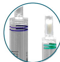
Color coded rings for easy identification

Dispenser box allows user to remove pipettes without opening top. Universal stacking design requires less laboratory space and each box is color coded for easy recognition.