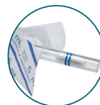
Fiber free paper wrap ensures quick peel apart opening